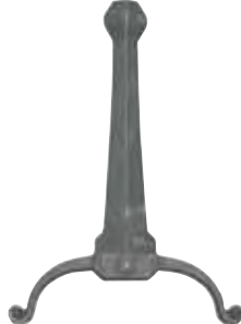
Wrought Iron Andiron